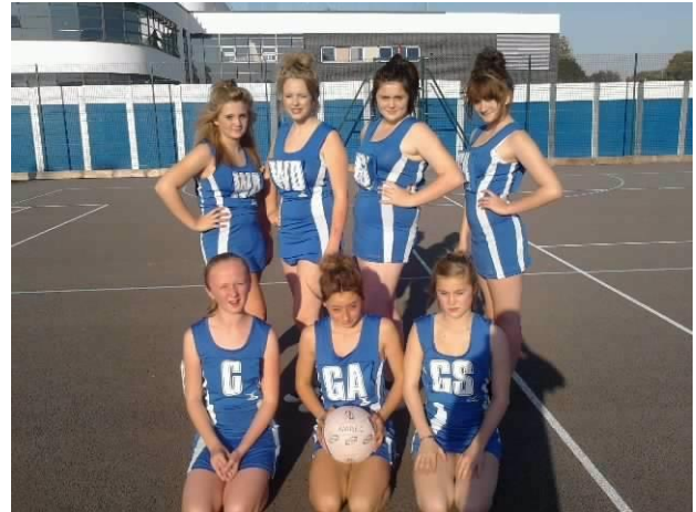
Year 9 Netball Team

Our Year 9 team have put in a massive amount of effort into their games and improved throughout each match played. Well done to everyone.