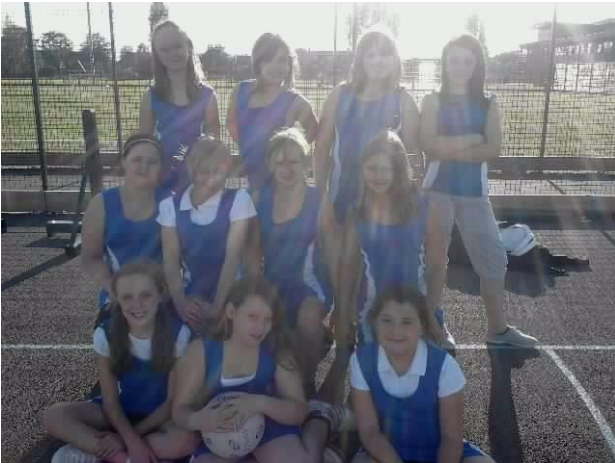
Year 7 Netball Team