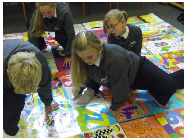
Maths Twister at the Year 6 parents evening.

“This is fantastic news for students and their families. It reflects the hard work of students, their families and teachers in preparing for these examinations.