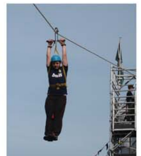
Action: Students soldiering through the assault course

Barham Road, Hull, HU9 4EE Telephone 01482 799132 Fax 01482 786804