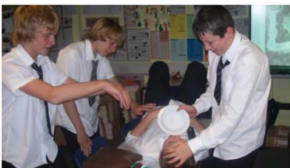
Cleansing in the sacred water....