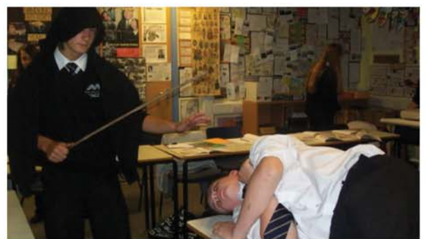
Asclepius visits to make the cure with his serpent