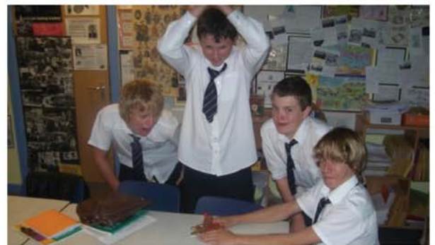
Making the sacrifice to the god....