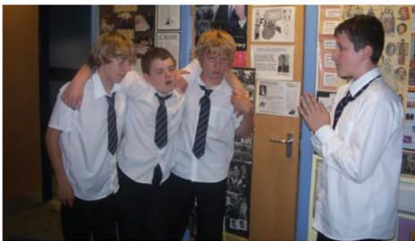
Arriving at the temple to Asclepius "I need healing...."